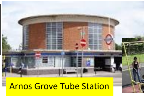
Arnos Grove Tube Station