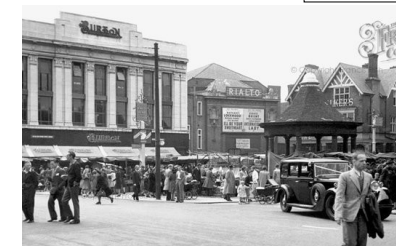
Enfield Town, market place 1950