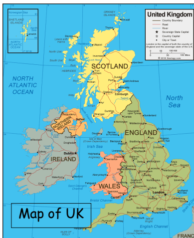
Map of UK