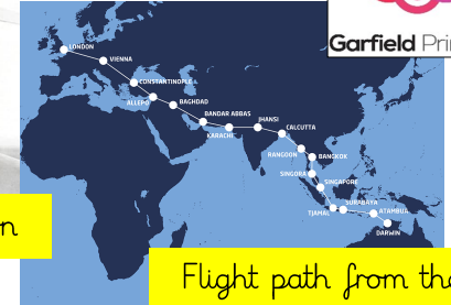
Flight path from the UK to Australia.