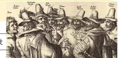
1605 Gunpowder plot

Annually on November 5th people celebrate Fireworks or Bonfire night.