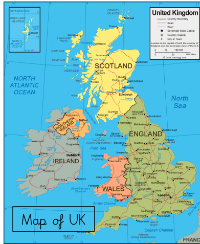
Map of UK