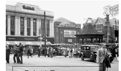
Enfield Town, market place 1950